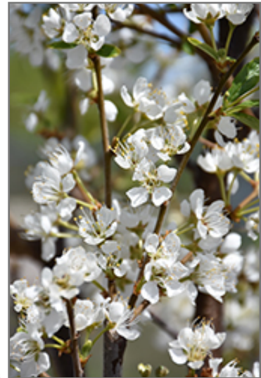
Toka Plum flowers