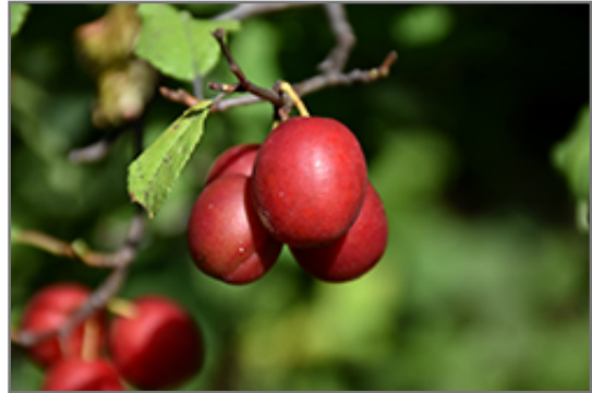
Toka Plum fruit