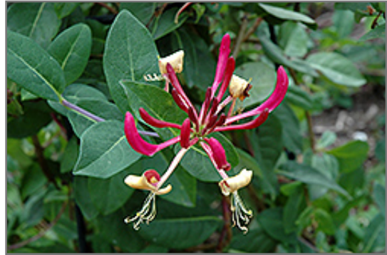
Peaches And Cream Honeysuckle flowers

This woody vine will require occasional maintenance and upkeep, and is best pruned in late winter once the threat of extreme cold has passed. It is a good choice for attracting butterflies and hummingbirds to your yard. It has no significant negative characteristics.