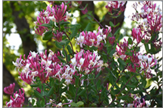
Peaches And Cream Honeysuckle flowers

Peaches And Cream Honeysuckle will grow to be about 20 feet tall at maturity, with a spread of 24 inches. As a climbing vine, it tends to be leggy near the base and should be underplanted with low-growing facer plants. It should be planted near a fence, trellis or other landscape structure where it can be trained to grow upwards on it, or allowed to trail off a retaining wall or slope. It grows at a medium rate, and under ideal conditions can be expected to live for approximately 20 years.