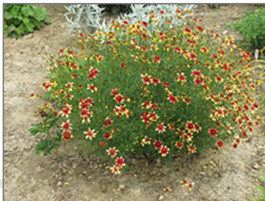
Route 66 Tickseed