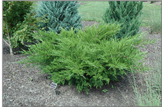
Sea Green Juniper

Sea Green Juniper is recommended for the following landscape applications;