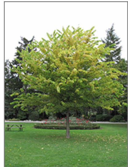
Hackberry in fall