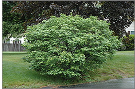
Dwarf Winged Euonymus

This shrub performs well in both full sun and full shade. It is very adaptable to both dry and moist locations, and should do just fine under average home landscape conditions. It is not particular as to soil type or pH. It is highly tolerant of urban pollution and will even thrive in inner city environments. This is a selected variety of a species not originally from North America.