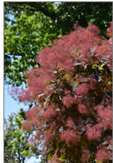
Grace Smokebush flowers