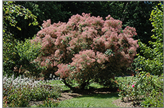
Grace Smokebush in bloom

This shrub will require occasional maintenance and upkeep, and is best pruned in late winter once the threat of extreme cold has passed. Deer don't particularly care for this plant and will usually leave it alone in favor of tastier treats. It has no significant negative characteristics.