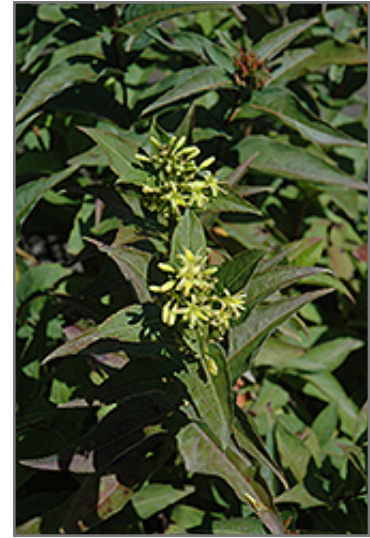
Butterfly Bush Honeysuckle flowers

Butterfly Bush Honeysuckle is recommended for the following landscape applications;