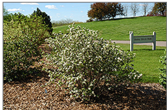
Autumn Magic Chokeberry in bloom