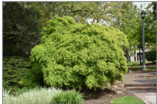
Japanese Viridis Maple