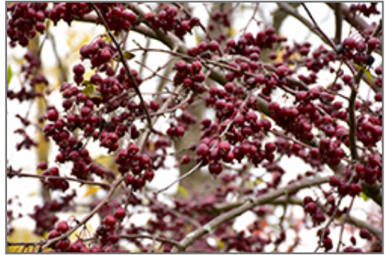
Purple Prince Flowering Crab fruit

This tree should only be grown in full sunlight. It prefers to grow in average to moist conditions, and shouldn't be allowed to dry out. It is not particular as to soil type or pH. It is highly tolerant of urban pollution and will even thrive in inner city environments. This particular variety is an interspecific hybrid.