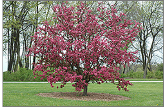
Purple Prince Flowering Crab in bloom

This tree will require occasional maintenance and upkeep, and is best pruned in late winter once the threat of extreme cold has passed. It is a good choice for attracting birds to your yard. It has no significant negative characteristics.