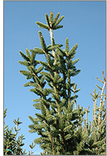
Cupressina Norway Spruce foliage