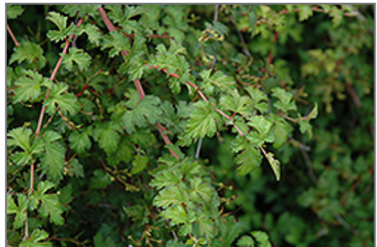
Crispa Cutleaf Stephanandra foliage