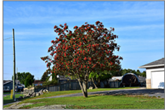
Showy Mountain Ash fruit