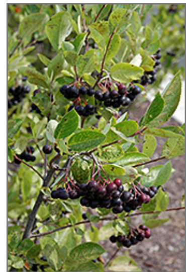
Iroquois Beauty Chokeberry fruit