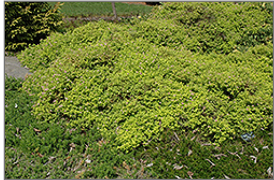
Golden Elf Spirea

Golden Elf Spirea is recommended for the following landscape applications;