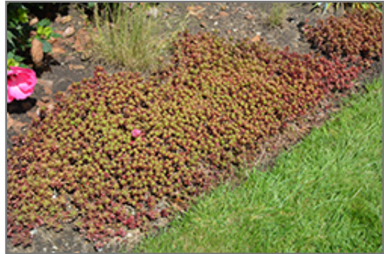
Fulda Glow Stonecrop