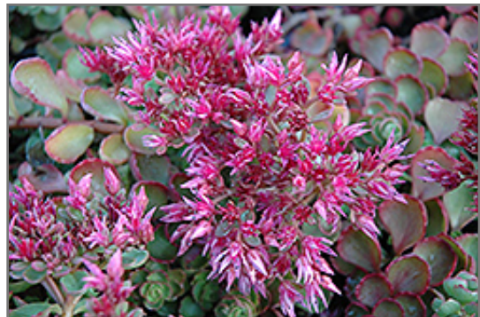
Fulda Glow Stonecrop flowers