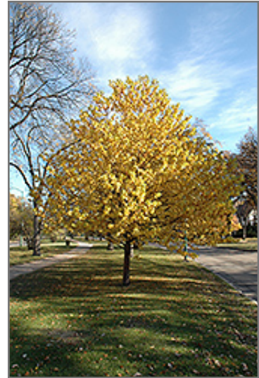
Amur Cherry in fall

This tree should only be grown in full sunlight. It does best in average to evenly moist conditions, but will not tolerate standing water. It is not particular as to soil type or pH. It is somewhat tolerant of urban pollution. This species is not originally from North America.