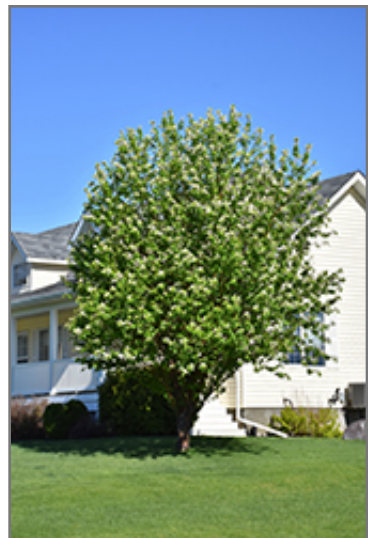
Amur Cherry