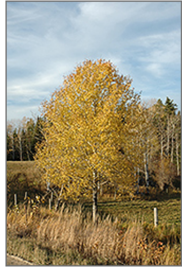
Quaking Aspen in fall

This tree should only be grown in full sunlight. It is an amazingly adaptable plant, tolerating both dry conditions and even some standing water. It is not particular as to soil type or pH. It is quite intolerant of urban pollution, therefore inner city or urban streetside plantings are best avoided. This species is native to parts of North America.