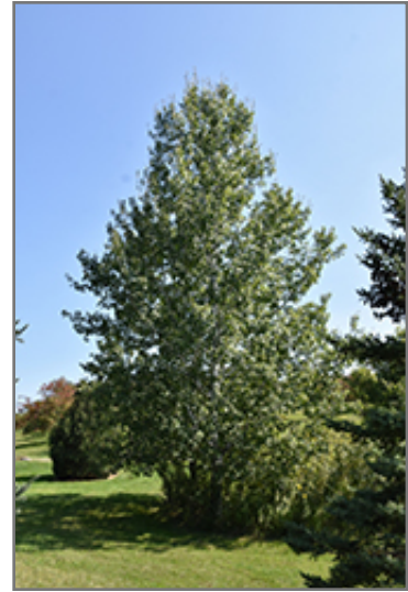
Quaking Aspen

Quaking Aspen is recommended for the following landscape applications;