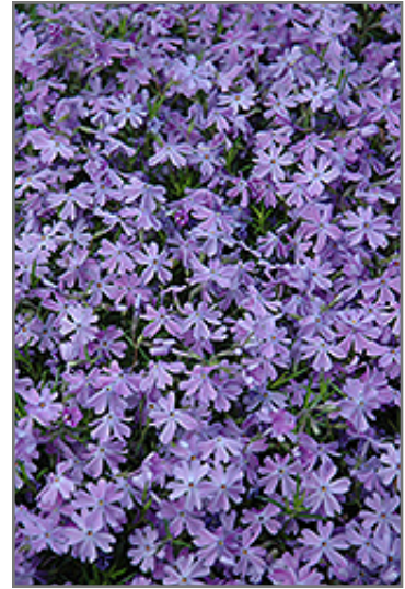
Emerald Blue Moss Phlox flowers

Emerald Blue Moss Phlox is recommended for the following landscape applications;