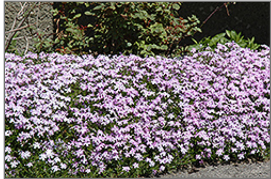
Emerald Blue Moss Phlox in bloom

Emerald Blue Moss Phlox will grow to be only 4 inches tall at maturity, with a spread of 18 inches. When grown in masses or used as a bedding plant, individual plants should be spaced approximately 15 inches apart. Its foliage tends to remain low and dense right to the ground. It grows at a medium rate, and under ideal conditions can be expected to live for approximately 10 years. As an evergreen perennial, this plant will typically keep its form and foliage year-round.