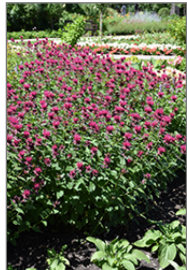
Raspberry Wine Monarda in bloom