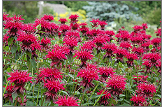
Raspberry Wine Monarda flowers