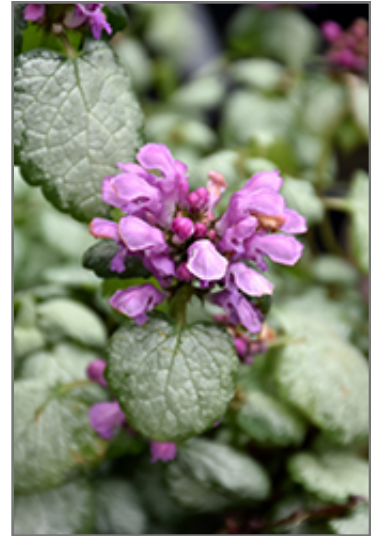
Red Nancy Lamium flowers