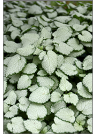
Red Nancy Lamium foliage

Red Nancy Lamium is a fine choice for the garden, but it is also a good selection for planting in outdoor pots and containers. Because of its spreading habit of growth, it is ideally suited for use as a 'spiller' in the 'spiller-thriller-filler' container combination; plant it near the edges where it can spill gracefully over the pot. Note that when growing plants in outdoor containers and baskets, they may require more frequent waterings than they would in the yard or garden. Be aware that in our climate, most plants cannot be expected to survive the winter if left in containers outdoors, and this plant is no exception. Contact our experts for more information on how to protect it over the winter months.