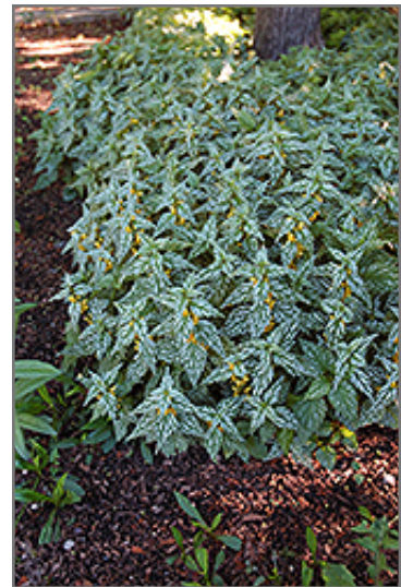
Herman's Pride Lamiastrum in bloom