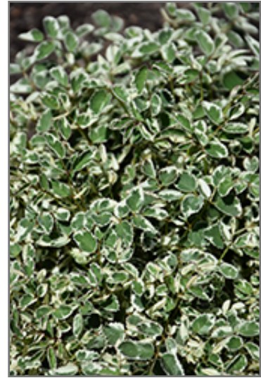
Little Angel Burnet flowers

Little Angel Burnet will grow to be only 4 inches tall at maturity extending to 10 inches tall with the flowers, with a spread of 14 inches. When grown in masses or used as a bedding plant, individual plants should be spaced approximately 12 inches apart. It grows at a medium rate, and under ideal conditions can be expected to live for approximately 15 years. As an herbaceous perennial, this plant will usually die back to the crown each winter, and will regrow from the base each spring. Be careful not to disturb the crown in late winter when it may not be readily seen!