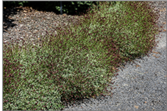
Little Angel Burnet in bloom