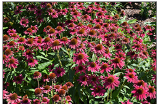
Sombrero Tres Amigos Coneflower in bloom