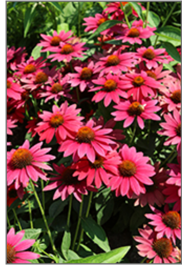
Sombrero Tres Amigos Coneflower flowers

Sombrero Tres Amigos Coneflower is an herbaceous perennial with an upright spreading habit of growth. Its medium texture blends into the garden, but can always be balanced by a couple of finer or coarser plants for an effective composition.