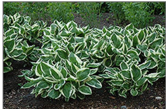
Minuteman Hosta