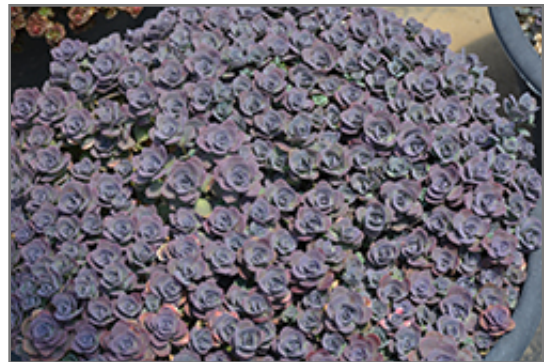
SunSparkler Blue Elf Sedoro