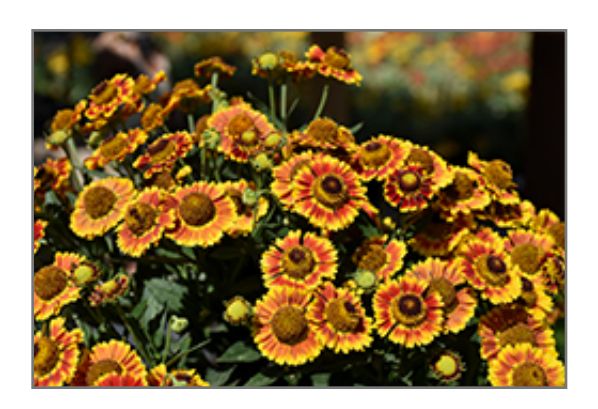
Mariachi Fuego Sneezeweed flowers

Mariachi Fuego Sneezeweed is recommended for the following landscape applications;