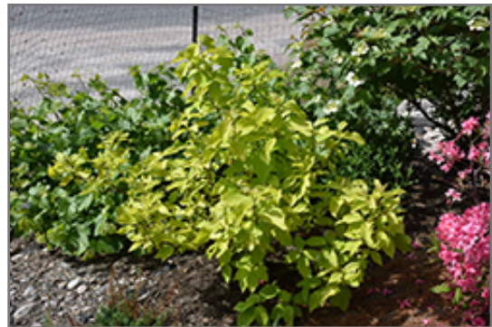
Neon Burst Dogwood