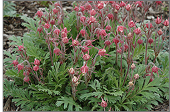
Three-Flowered Avens in bloom

Three-Flowered Avens is recommended for the following landscape applications;