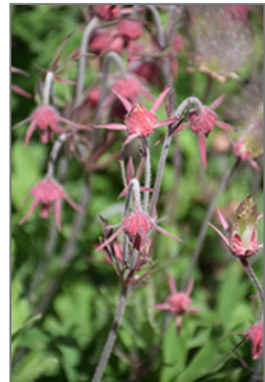
Three-Flowered Avens flower buds