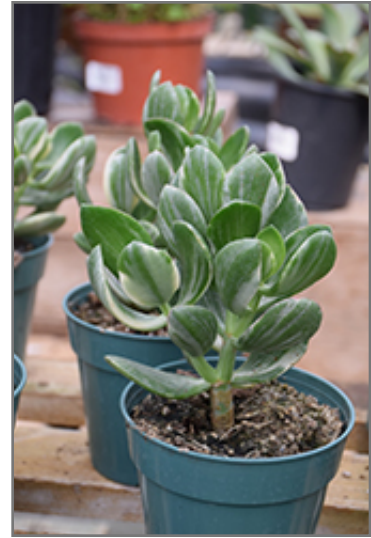
Variegated Jade Plant in full

This is a multi-stemmed evergreen houseplant with an upright spreading habit of growth. This plant can be pruned at any time to keep it looking its best.