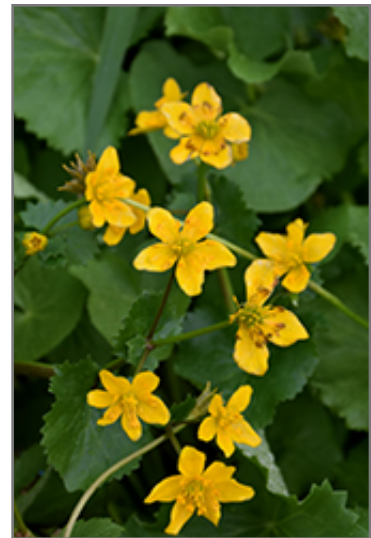
Marsh Marigold flowers