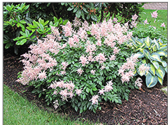
Peach Blossom Astilbe in bloom