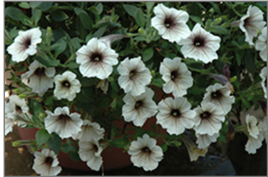
Supertunia Latte Petunia flowers

Supertunia Latte Petunia is recommended for the following landscape applications;