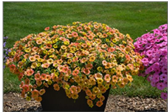
Supertunia Honey Petunia in bloom