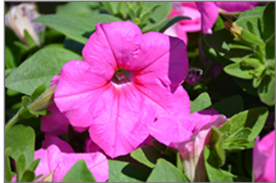
Easy Wave Pink Passion Petunia flowers

Easy Wave Pink Passion Petunia is recommended for the following landscape applications;