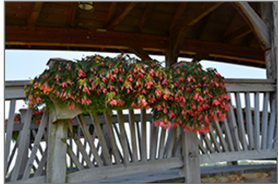
San Francisco Begonia in bloom

San Francisco Begonia is a fine choice for the garden, but it is also a good selection for planting in outdoor containers and hanging baskets. Because of its trailing habit of growth, it is ideally suited for use as a 'spiller' in the 'spiller-thriller-filler' container combination; plant it near the edges where it can spill gracefully over the pot. Note that when growing plants in outdoor containers and baskets, they may require more frequent waterings than they would in the yard or garden.