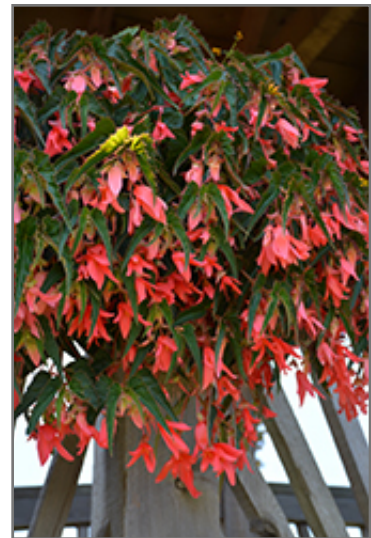
San Francisco Begonia in bloom