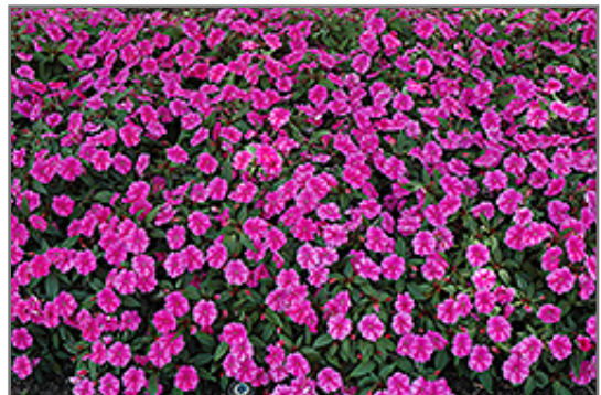
Bounce Pink Flame Impatiens in bloom