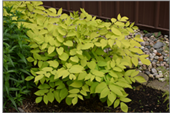
Sun King Japanese Spikenard