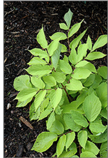
Sun King Japanese Spikenard foliage

This plant performs well in both full sun and full shade. It prefers to grow in average to moist conditions, and shouldn't be allowed to dry out. It is not particular as to soil type or pH. It is highly tolerant of urban pollution and will even thrive in inner city environments. This is a selected variety of a species not originally from North America.