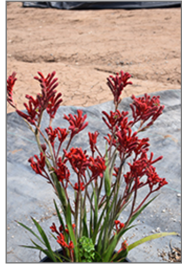
Kanga Red Kangaroo Paw in bloom