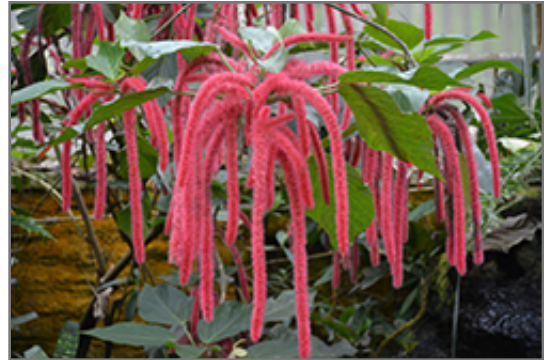
Firetail Chenille Plant flowers