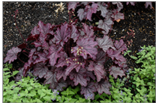
Spellbound Coral Bells