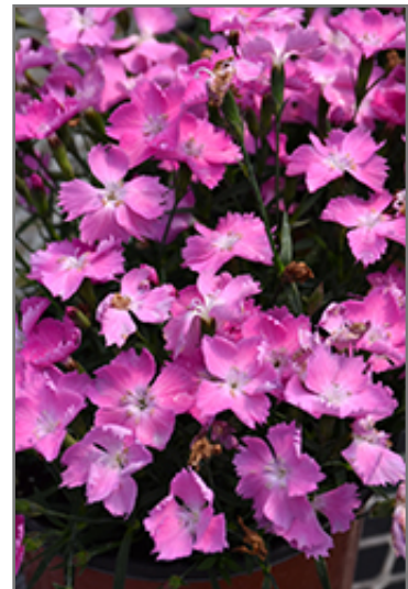
Kahori Dianthus flowers