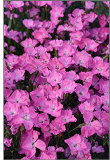
Kahori Dianthus flowers

Kahori Dianthus is recommended for the following landscape applications;