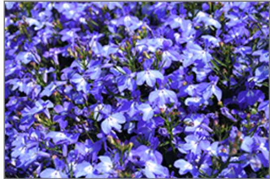
Techno Light Blue Lobelia flowers

Techno Light Blue Lobelia is recommended for the following landscape applications;