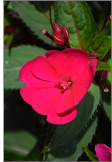
SunPatiens Compact Royal Magenta New Guinea Impatiens flowers

This plant will require occasional maintenance and upkeep, and should not require much pruning, except when necessary, such as to remove dieback. It is a good choice for attracting bees and butterflies to your yard. It has no significant negative characteristics.