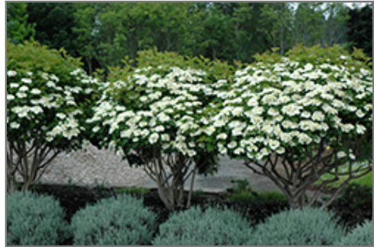
Compact European Viburnum in bloom

Compact European Viburnum is a dense multi-stemmed deciduous shrub with a more or less rounded form. Its average texture blends into the landscape, but can be balanced by one or two finer or coarser trees or shrubs for an effective composition.