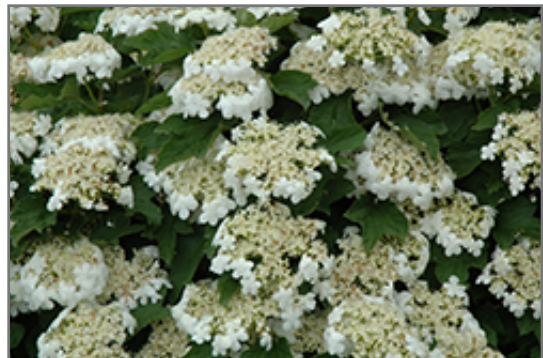
Compact European Viburnum flowers