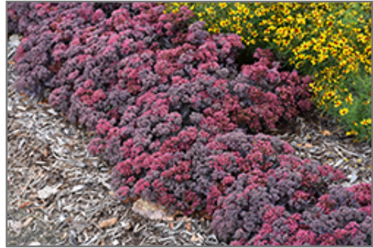
Dazzleberry Sedum in bloom