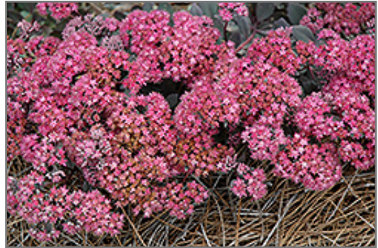
Dazzleberry Sedum flowers

Dazzleberry Sedum is a dense herbaceous perennial with an upright spreading habit of growth. Its medium texture blends into the garden, but can always be balanced by a couple of finer or coarser plants for an effective composition.