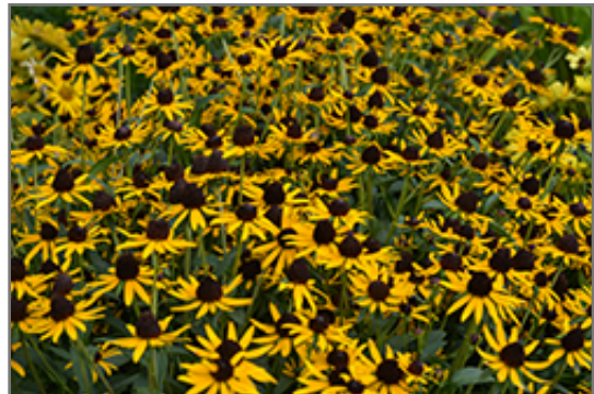
Little Goldstar Rudbeckia flowers