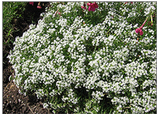
Wonderland White Alyssum in bloom