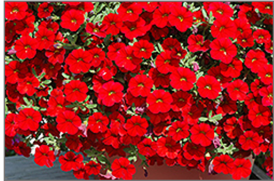
Cabaret Bright Red Calibrachoa flowers

This plant will require occasional maintenance and upkeep. Trim off the flower heads after they fade and die to encourage more blooms late into the season. It is a good choice for attracting bees and hummingbirds to your yard, but is not particularly attractive to deer who tend to leave it alone in favor of tastier treats. It has no significant negative characteristics.